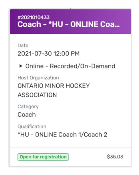
Coach 2 - HCR 3.0 - Hockey Canada Registry

Coach – Pre-requisite course - HU Online 1 / 2 - HCR 3.0 - Hockey Canada Registry and Specialty Skills – HU Online Checking and then the Coach 2 course can be completed.